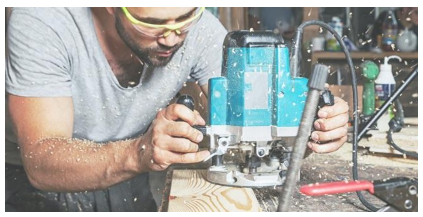
for EASY installation – milling tool

The milling tool is used to do the milling inside the panel. The 3 available models have the same purpose but differ in the number of knives or axe diameter to fit in your machine.